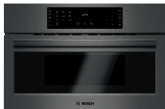
HMC80242UC Black Stainless Steel